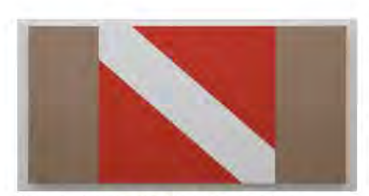
Matthew Metzger, The Dead Man (The Dead Toreador), 2010, oil on panel, 29 7/8 x 60 3/8".