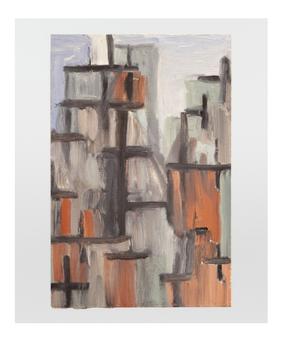
Martha Diamond 16, 1989 Oil on Masonite 9h x 6w in MDi_143