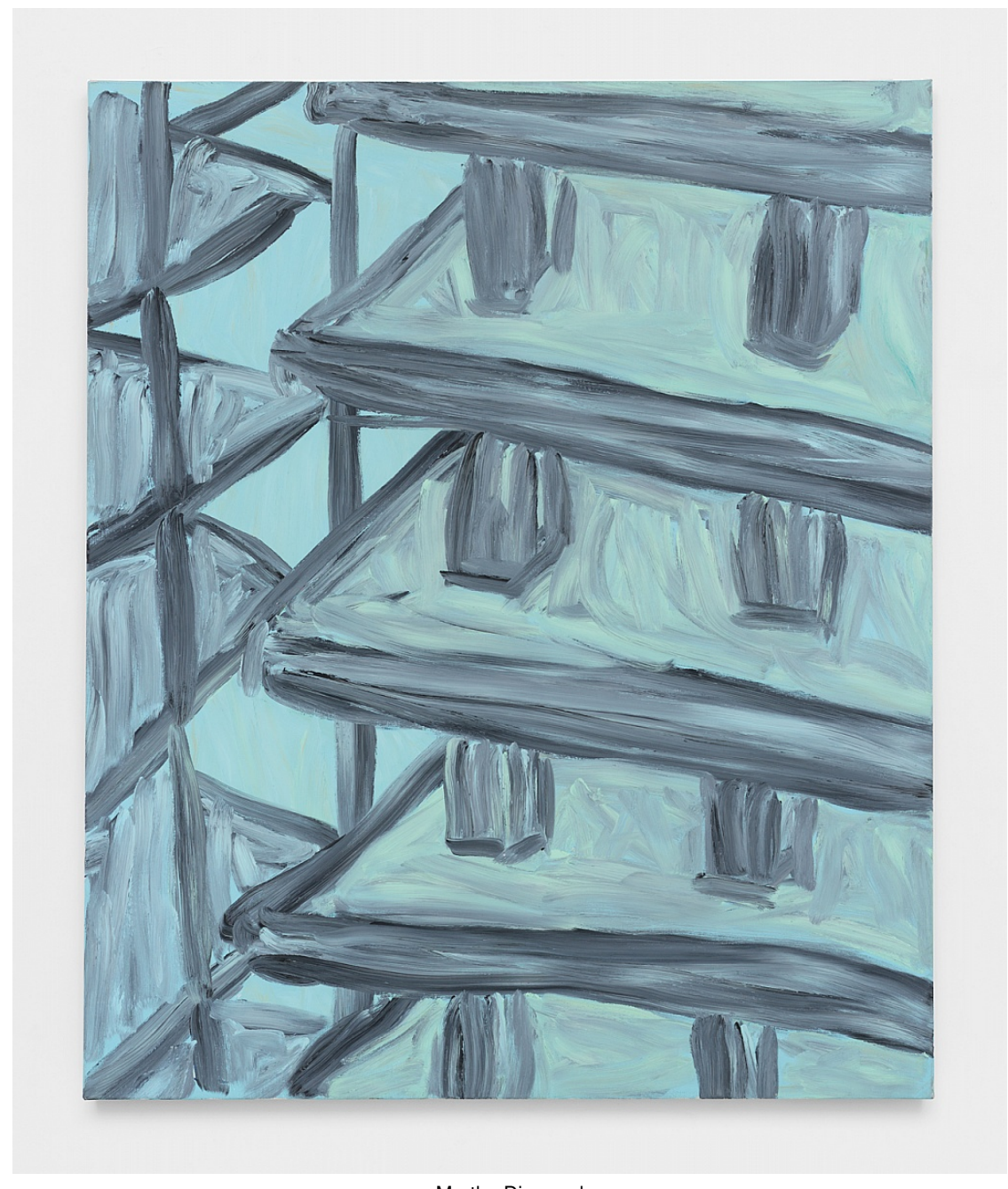
Martha Diamond Pale Blue Construction, 1985 Oil on linen 72h x 60w in MDi_115