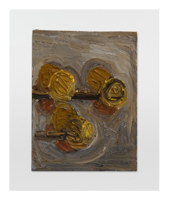
Martha Diamond Untitled 16, 1987 Oil on Masonite 8h x 6w in MDi_017