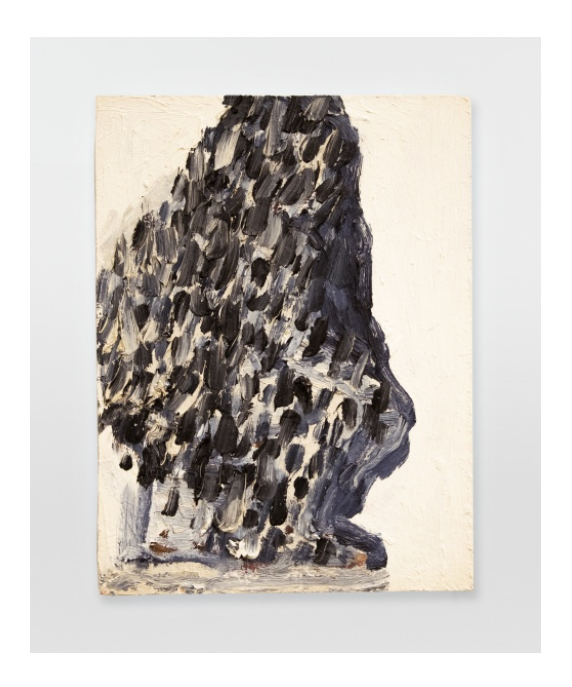
Martha Diamond Untitled, 2011 Oil on Masonite 7.75h x 5.88w in MDi_196