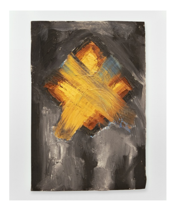
Martha Diamond Untitled, c.1980s Oil on Masonite 8h x 5.50w in MDi_184