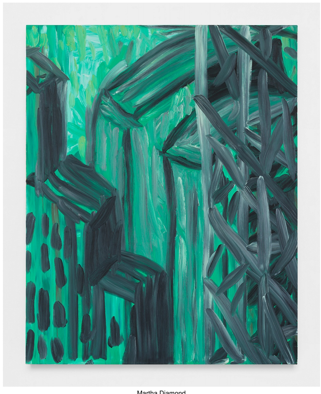
Martha Diamond Green Cityscape, 1985 Oil on linen 90h x 72w in MDi_101