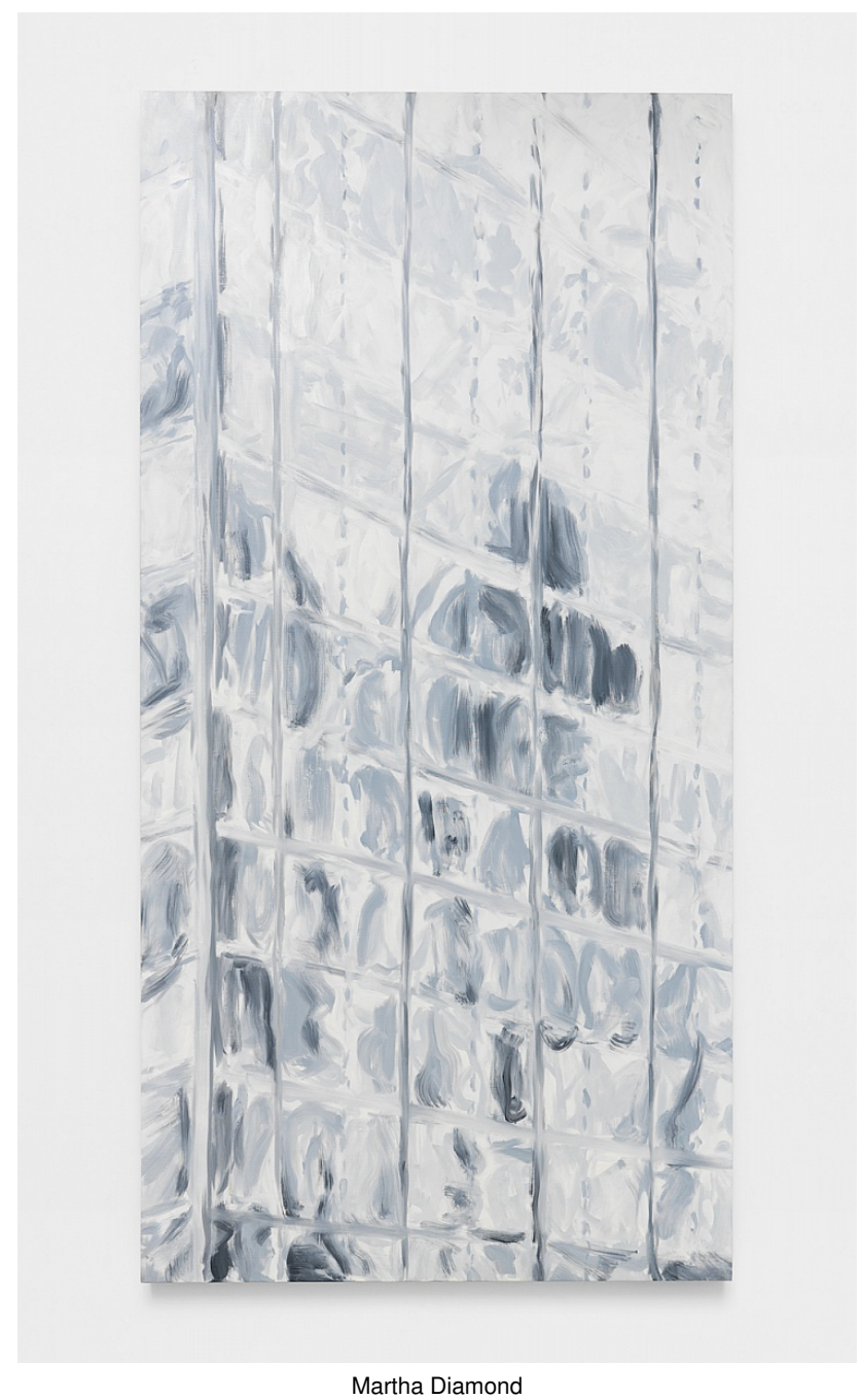
Cityscape, 2000 Oil on linen 96h x 48w in MDi_174