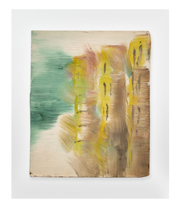
Martha Diamond Untitled, 1988 Oil on Masonite 9h x 7.38w in MDi_182