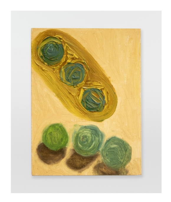
Martha Diamond Untitled, c. 1980s Oil on Masonite 8.25h x 6w in MDi_133