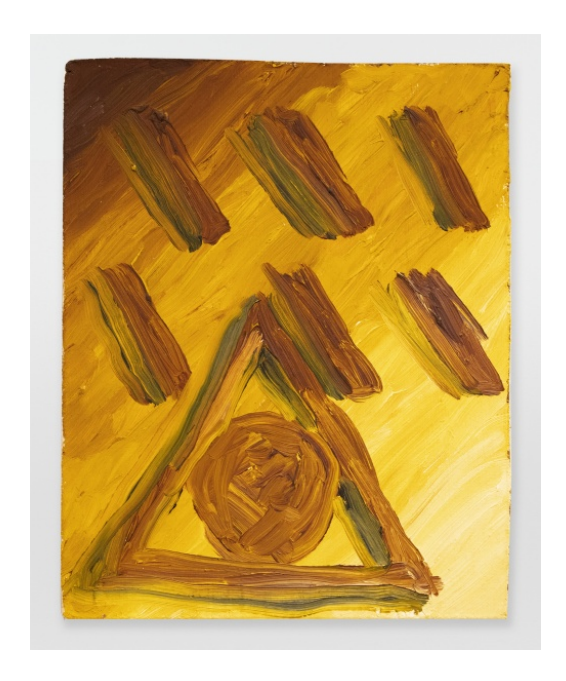
Martha Diamond Untitled, 1988 Oil on Masonite 9h x 7.25w in MDi_177