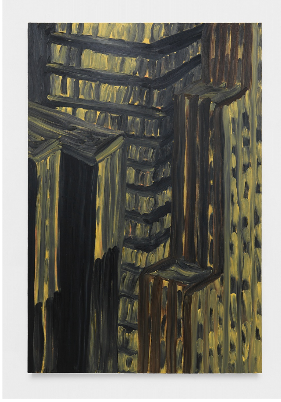
Martha Diamond Untitled, c. 1980s Oil on linen 90h x 60w in MDi_154