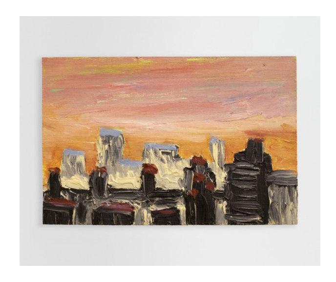
Martha Diamond Untitled, 1987 Oil on Masonite 6h x 9w in MDi_199