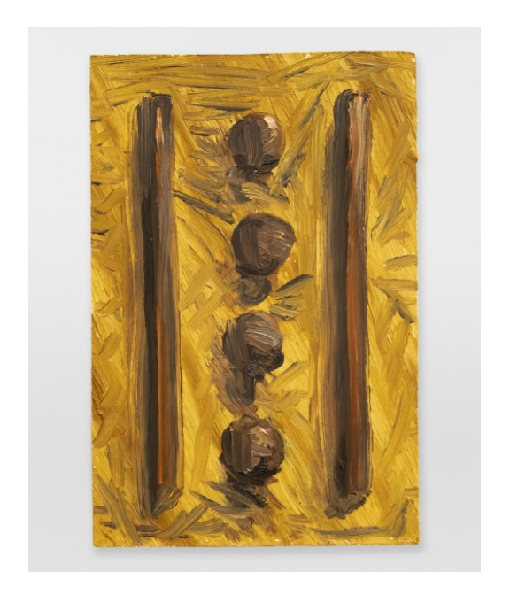
Martha Diamond Untitled, 1987 Oil on Masonite 9h x 6w in MDi_137