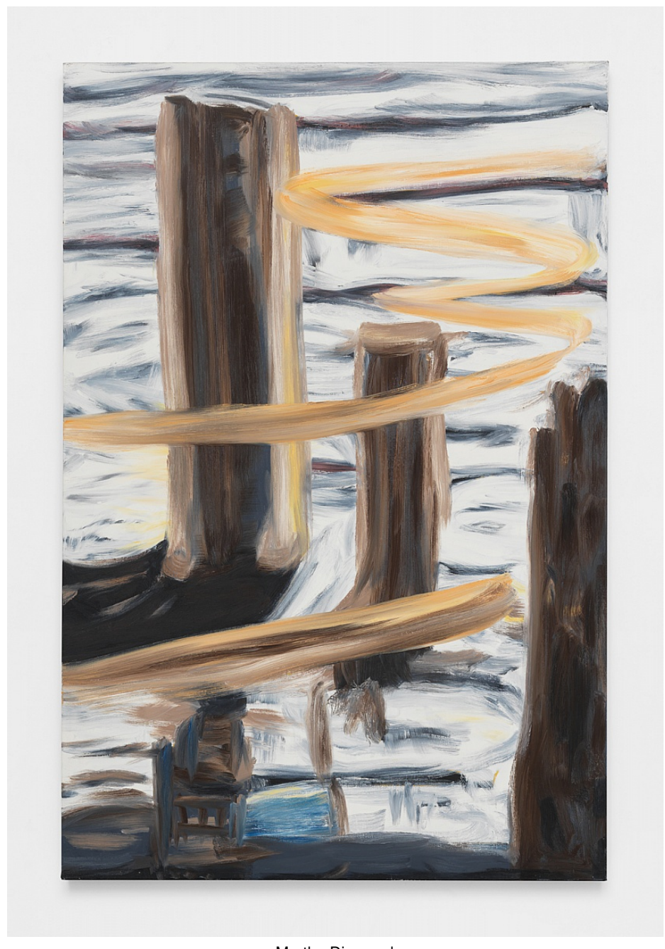
Martha Diamond Untitled (Swirl), 1990 Oil on linen 72h x 48w in MDi_119