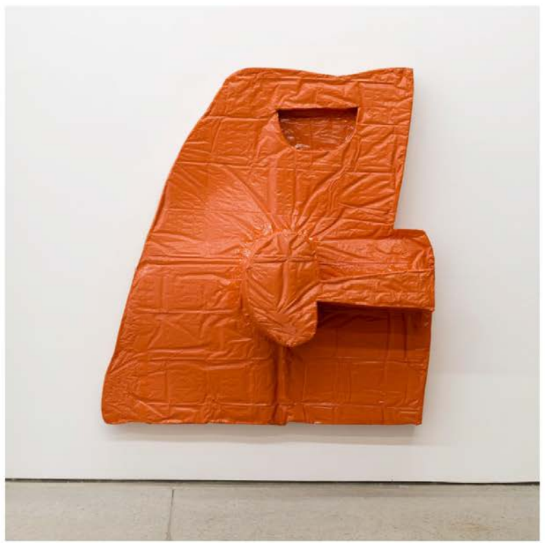
Daniel Boccato, "tokeface" (2016), epoxy, fiberglass and polyurethane, 83 x 77 x 23 inches

As to Boccato's artistic lineage, Richard Tuttle made thickish, shape-heavy wall works in the 1960s, though they are painted plywood, much smaller, and generally desaturated in color. In the same vein is Imi Knoebel's "24 Colors — For Blinky" (1977), a group of 24 large, oddly shaped, chromatically exacting monochrome paintings on 4-inch-deep wood panels. (The set was recreated under Knoebel's supervision in 2008 for an installation at Dia:Beacon.) Doreen McCarthy has recently shown some eccentrically shaped, inflatable monochrome sculptures that allude to biological forms without representing one; Justin Adian's pillowy, stuffed-canvas works, while not invariably monochrome, are similar to Boccato's high reliefs in their wall-flowering three-dimensionality. This necessarily abbreviated list of kindred spirits must include the late, great Richard Artschwager, who presided over the mid-'60s marriage of minimalism and Pop and whose influence I sense in Boccato's choice of industrial materials, minute attention to craft, and deadpan presentation.