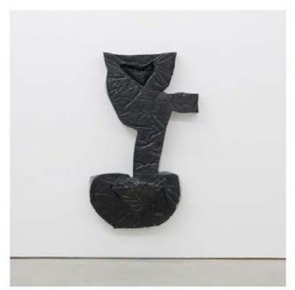
Daniel Boccato, "ribface" (2016), epoxy, fiberglass and polyurethane, 80 x 49 x 15 inches

This work has moxie, a quality many collectors seem to appreciate. But it may be that six Boccatos in one space are five too many. To come upon "ribface," for example, while wandering around a museum or corporate lobby might be tremendously exciting. It is the black one, nearly seven feet high and over a foot deep, and inscrutable to an extent the others are not. Its knotty, goofy shape doesn't signify anything in