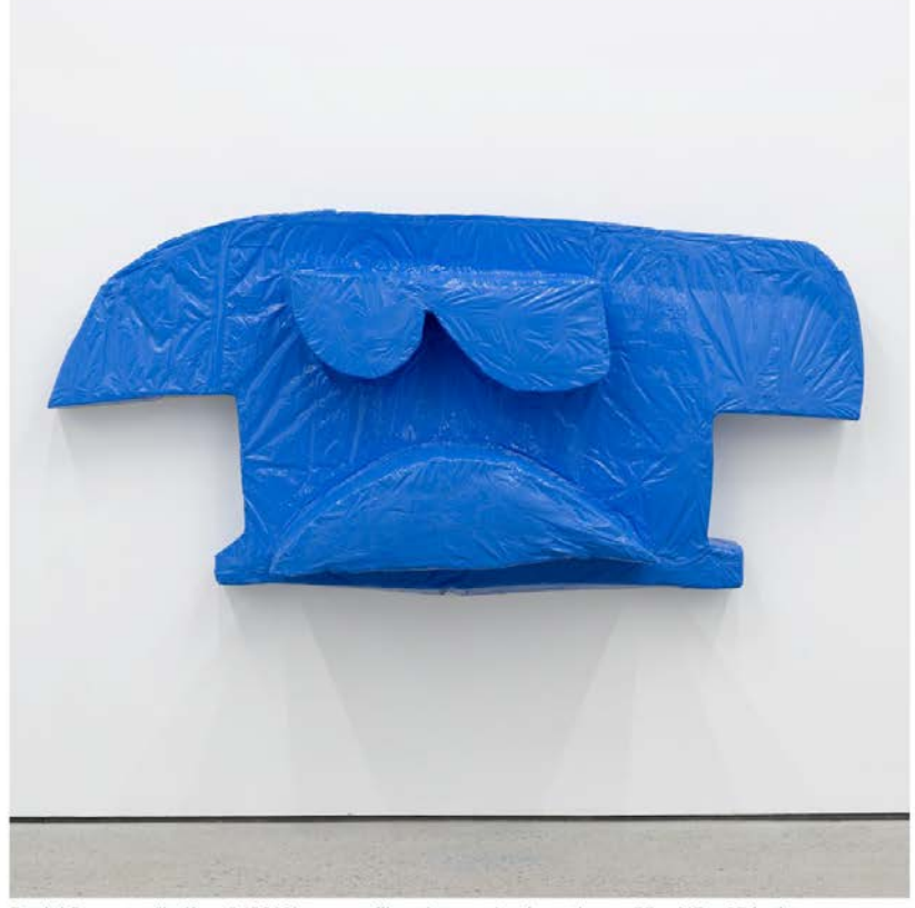
Daniel Boccato, "belface" (2016), epoxy, fiberglass and polyurethane, 55 x 117 x 27 inches

The outside contour of "belface" recalls a rotary telephone; roughly semicircular shapes take it a second step into real space, indicating downcast eyes and an angry frown. If the work's title refers to the old phone company, Bell, then it's easy to think of this scowl as the aftermath of a disconnection. But what about "laxface"? Has it something to do with negligence, or the Los Angeles airport, or magnesium citrate? The work is four-and-a-half feet high, bottom-heavy like an ink bottle, sporting a centrally located cylinder for a nose and a gaping mouth that, in an animated cartoon, would signify a panicked bellow. ("WIL-MAAA!")