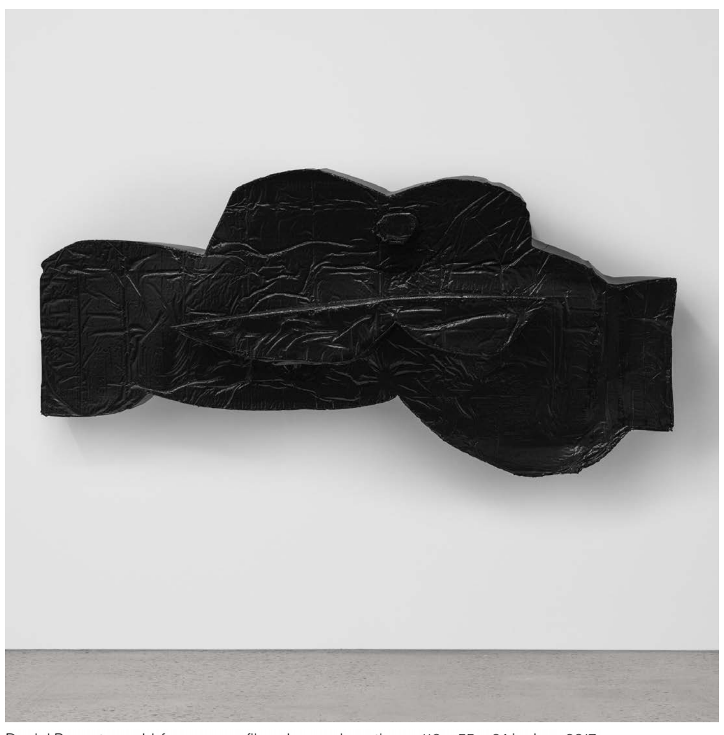
Daniel Boccato, mobbface, epoxy, fiberglass, polyurethane, 110 \times 55 \times 24 inches, 2017