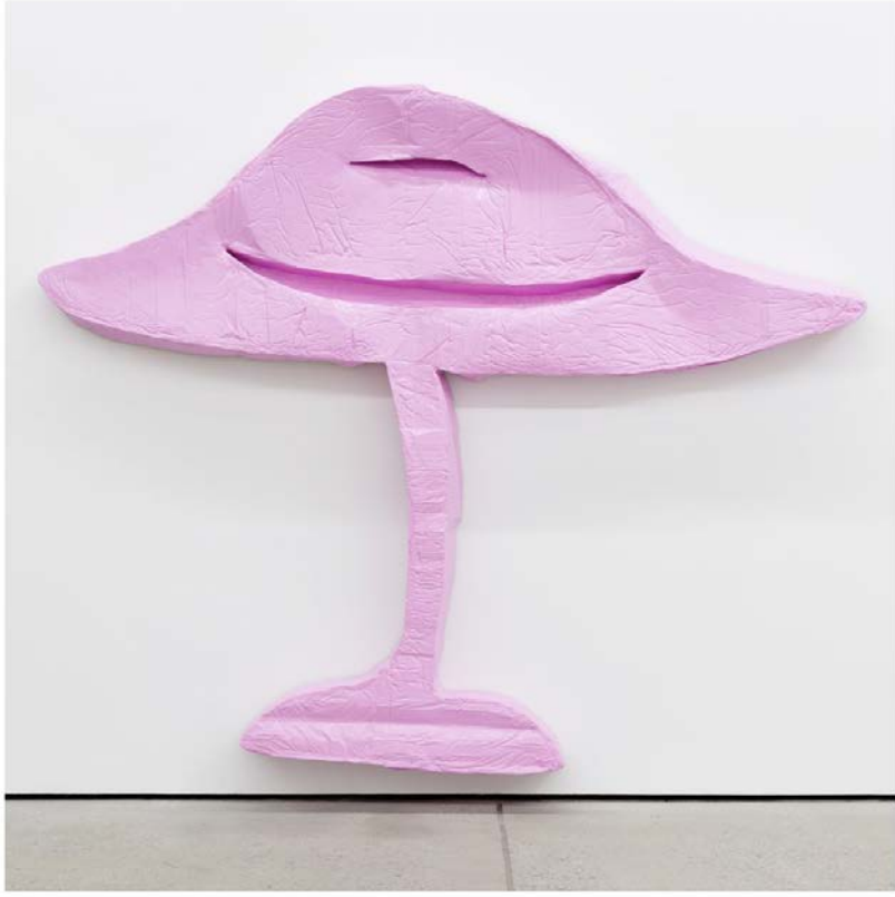
Daniel Boccato, "knipface" (2016), epoxy, fiberglass and polyurethane, 114 x 94 x 8 inches

This is not to deny the artist's considerable achievement with this show, which has both forcefulness and staying power. The shapes of these monochrome works (and their titles) refer obliquely to exterior sources; some may be entirely abstract, but even those seem to be motivated by observation of mechanical and/or natural forms. The front of the sculptures is parallel to the wall, from which they protrude a few inches to a couple of feet; they are, roughly speaking, silhouettes. But not entirely, because they are constructed in two or three levels or steps; within the overall shape are sections that either extend still further into space, or recede by a similar depth.