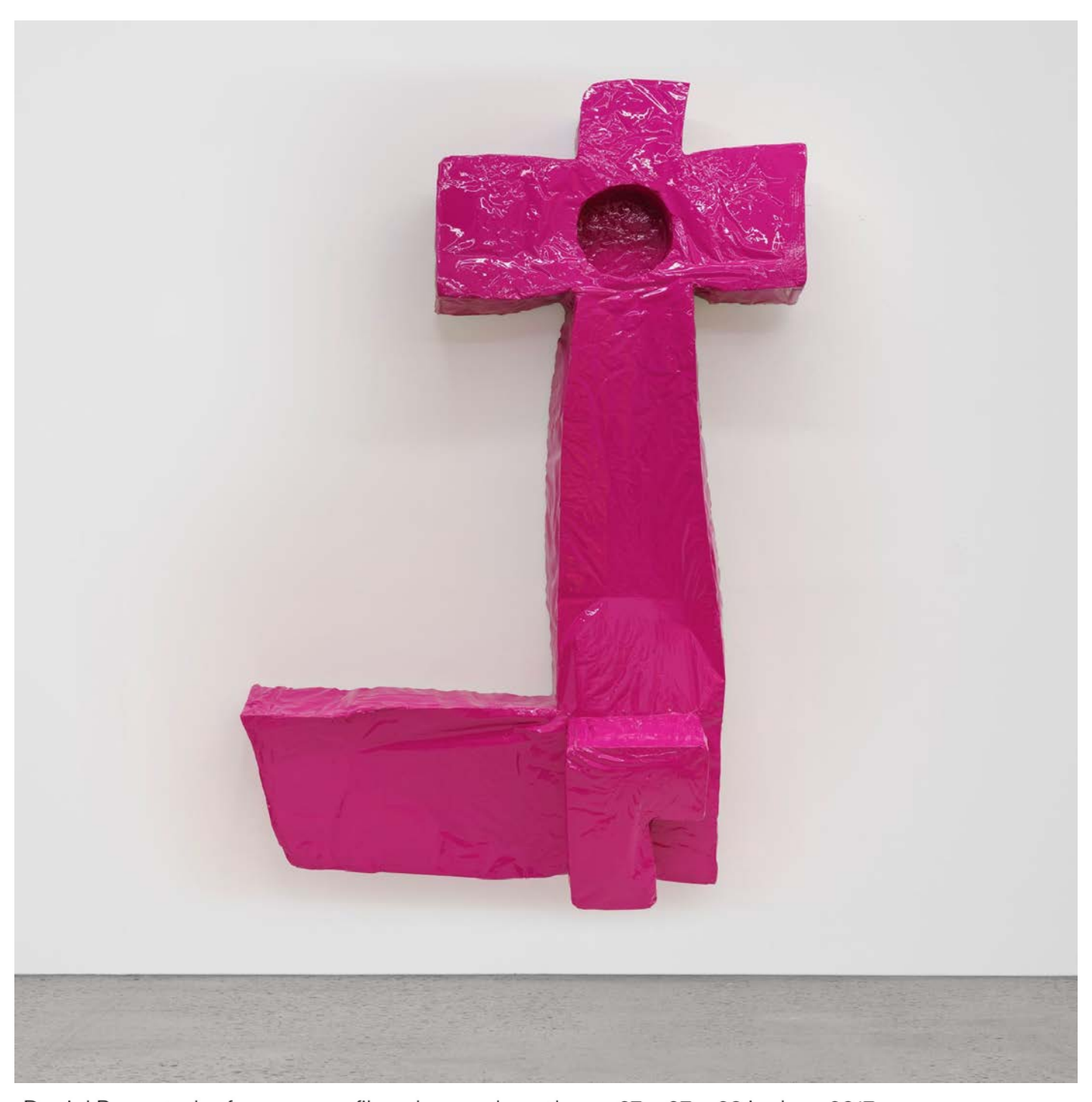
Daniel Boccato, lagface, epoxy, fiberglass, polyurethane, 67 \times 97 \times 28 inches, 2017