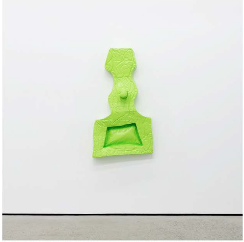
Daniel Boccato, "laxface" (2016), epoxy, fiberglass and polyurethane, 56 x 31 x 12 inches

The outside contour of "belface" recalls a rotary telephone; roughly semicircular shapes take it a second step into real space, indicating downcast eyes and an angry frown. If the work's title refers to the old phone company, Bell, then it's easy to think of this scowl as the aftermath of a disconnection. But what about "laxface"? Has it something to do with negligence, or the Los Angeles airport, or magnesium citrate? The work is four-and-a-half feet high, bottom-heavy like an ink bottle, sporting a centrally located cylinder for a nose and a gaping mouth that, in an animated cartoon, would signify a panicked bellow. ("WIL-MAAA!")