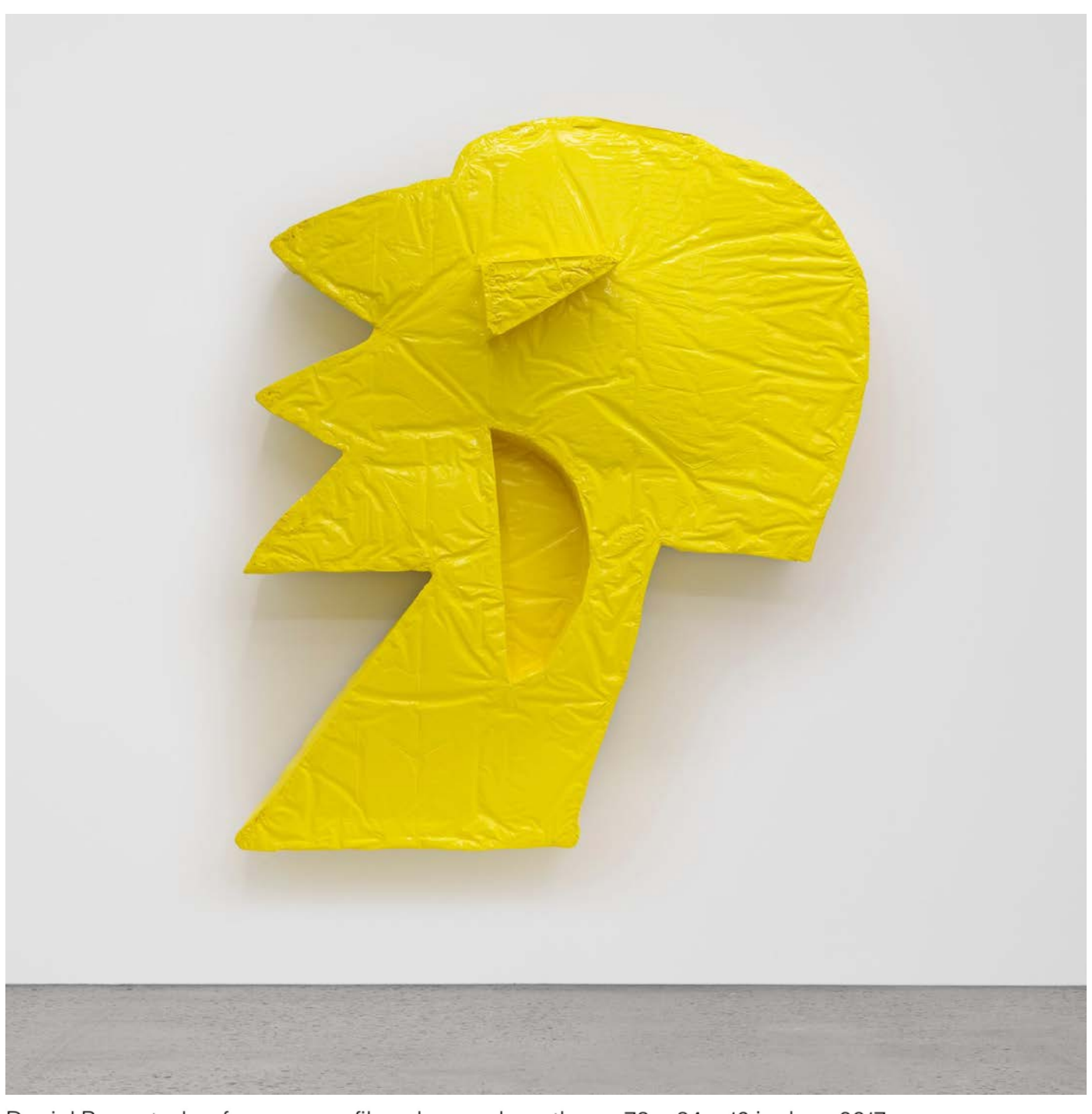
Daniel Boccato, hoxface, epoxy, fiberglass, polyurethane, 73 \times 84 \times 19 inches, 2017